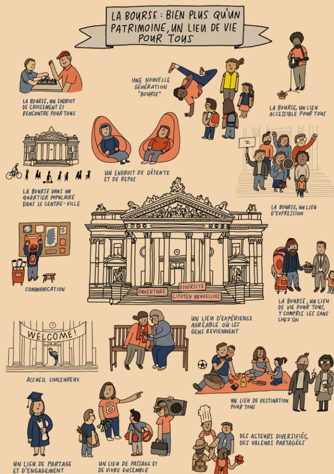
A graphical representation of the needs expressed by the public at the numerous public Citizen Participation meetings.

This Citizen Participation initiative has produced a result that takes concrete account of the needs, expectations and desires of the population .